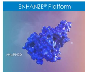
Uses proprietary, Halozyme rHuPH20 enzyme